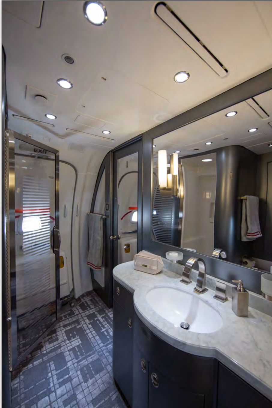
MASTER STATEROOM LAVATORY WITH SHOWER