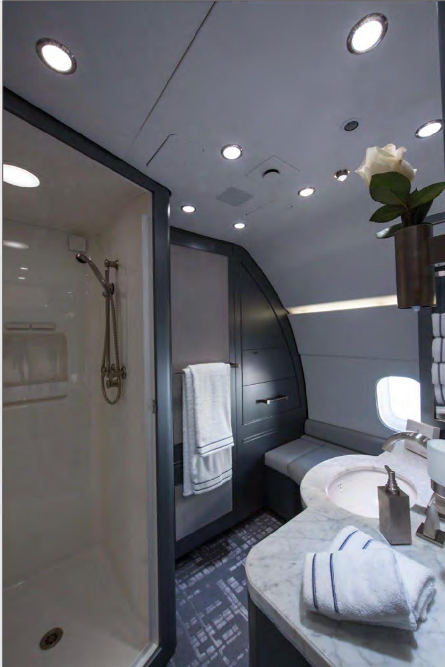
GUEST ROOM LAVATORY WITH SHOWER